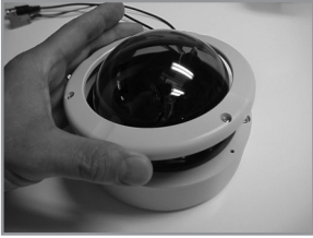
Remove Top Bezel