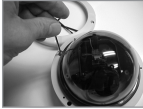
Remove Inner Screws