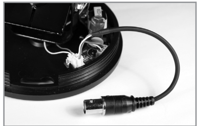
Secondary Video Output & Cable.

The VTD-C510 is equipped with a Secondary Video Output for ease of setup and adjustment. A 6" cable is included with the camera.