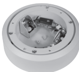
UTP Interface and Heater & Blower Options Available