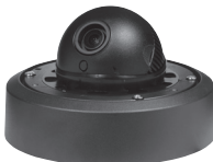
Mighty Dome Inside (Shown in Black)

WDR Wide Dynamic Range DIGITAL PIXEL SYSTEM FROM PIXIM